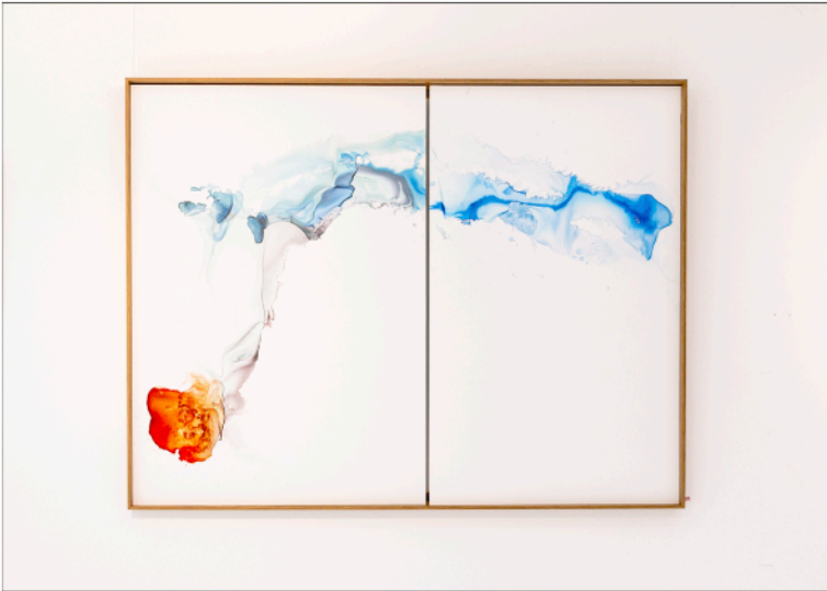
Elegien des Wassers #072 | 2023 | ink on paper | 100x140