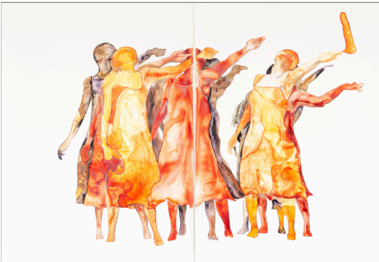
All woman in me are tired | 2023 | ink on paper | 100x140