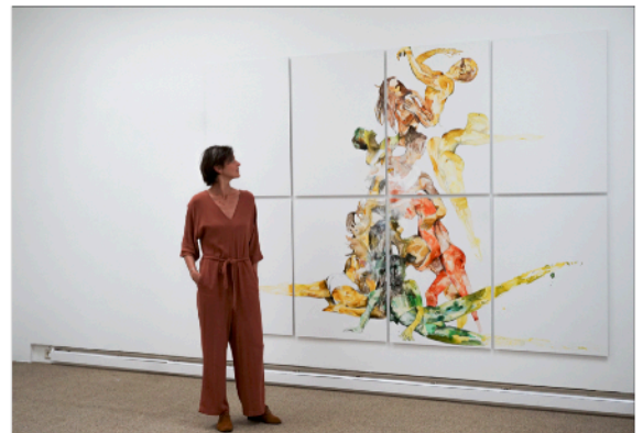
DANCER IN COLL' OR I | 2022 | ink on paper | 200x280